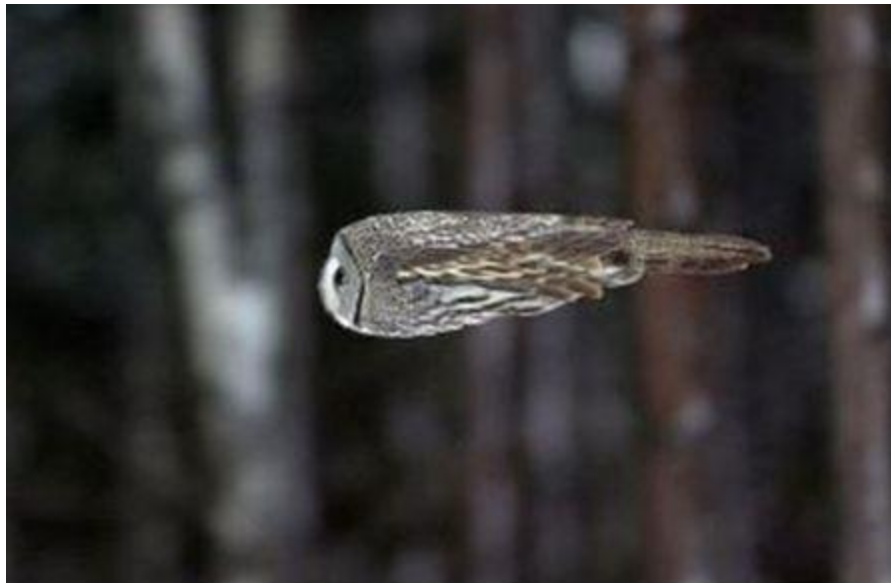
A picture I saw on the web. Hard to believe but it is a barn owl flying at full speed!

Until next time, take care everyone and enjoy yourselves.