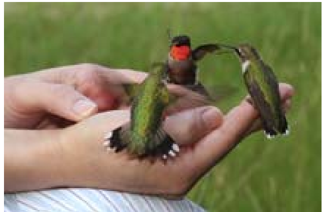
Humming birds in Georgia