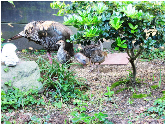
Wild turkey and chicks in my yard

We are fortunate to live where wild life is abundant. I am constantly taking photographs of birds, deer and other animals that wander (or fly) around my yard and I frequently see other people's images which are unusual Here are a couple: